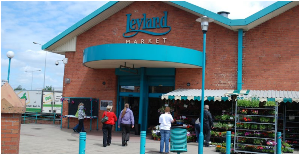
Central Lancashire Local Plan | Preferred Options - Part One Consultation

2.16 There are a number of settlements in South Ribble which include Longton, Higher Walton, Coupe Green and Gregson Lane in South Ribble. Within South Ribble, the settlements of Penwortham, Walton-le-Dale, Bamber Bridge and Lostock Hall (including Tardy Gate) form a fairly continuous urban area on the south side of the River Ribble.